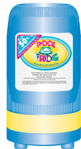
POOL FROG® MINERAL RESERVOIR

• The POOL FROG® system is three parts in one. First , the POOL FROG® Cyclor serves as a "water treatment center" and controls the flow of water. Second , the POOL FROG® Mineral Reservoir, the essential part of the system, is placed inside the POOL FROG® Cyclor and holds one season's worth of minerals. Third , a POOL FROG® Bac Pac is placed inside the POOL FROG® Mineral Reservoir, providing low level chlorine support.