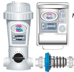
POOL FROG® Mineral Hybrid Combines Benefits of 2 Technologies for Complete Pool Care