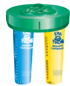
SPA FROG® Floating System Floats in Any Spa