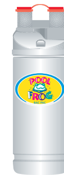
POOL FROG® BAC PAC

• POOL FROG® offers complete pool care in one unit. No extra plumbing. No extra headaches. And no electricity. Quite frankly, it's a riveting concept (ok it's a bad pun, but FROG® enjoyed it!)