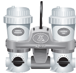
POOL FROG® XL PRO In Ground System with Ex-tended Pac Life