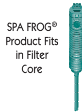
SPA FROG® Product Fits in Filter Core

KING TECHNOLOGY, INC. 952-933-6118 www.kingtechnology.com