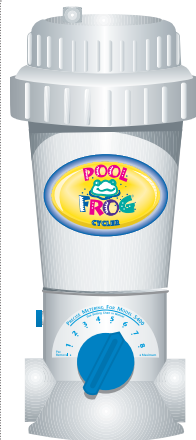
POOL FROG® IN GROUND CYCLOR