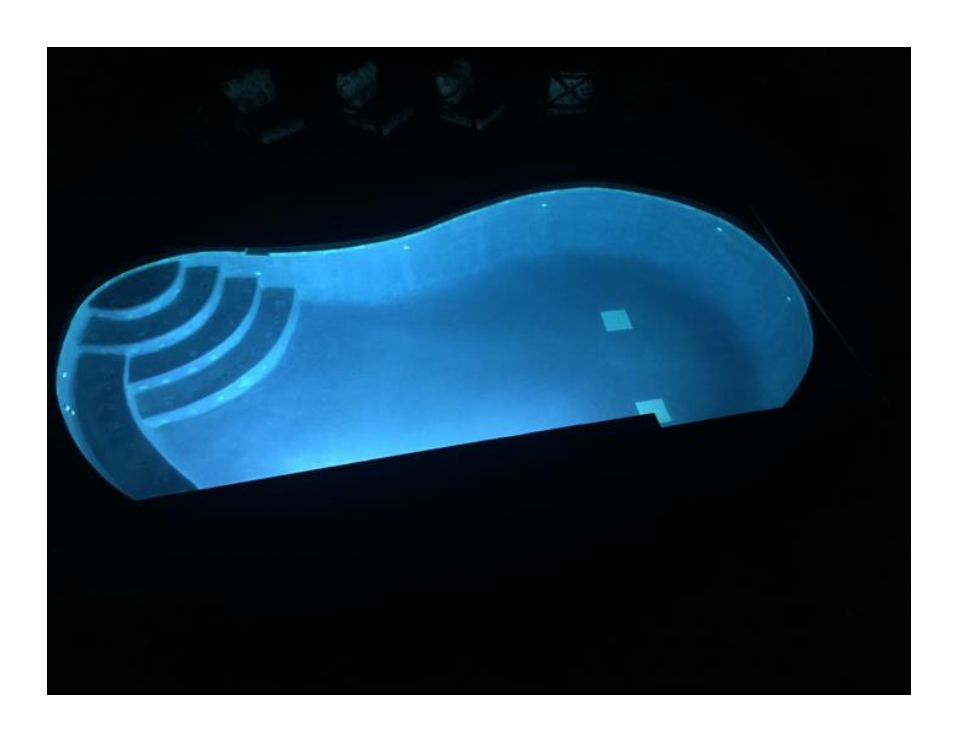
FilterBalls running on low: 1750 RPM 2.2 PSI with 32 GPM on just 147 watts of power 46,000 gallon/Day., $19/month, > 5turns/day