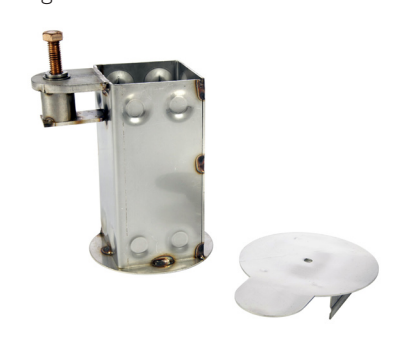
A completed Deck Profile form is required with your pool lift order.