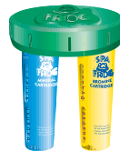
SPA FROG® Floating System Floats in Any Spa