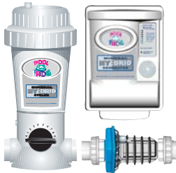
POOL FROG® Mineral Hybrid Combines Benefits of 2 Technologies for Complete Pool Care