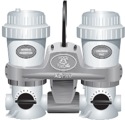
POOL FROG® XL PRO In Ground System with X-tended Pac Life