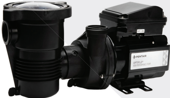
OptiFlo Aboveground Pool Pump

Note: The 3/4 HP OptiFlo, 1.5 HP OptiFlo and all Dynamo pumps represented here are non-compliant products included strictly for comparison. The new 1.0 THP OptiFlo represents the only series of pumps available for order.