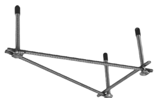
3 Bolt Jig for 3 Bolt Base with 6' GX Board

To select a color for board or base, add corresponding color code to the end of the part number above. To order 3 bolt base with NO JIG, replace "3B6" with "3B6NJ" or "3B8" with "3B8NJ".